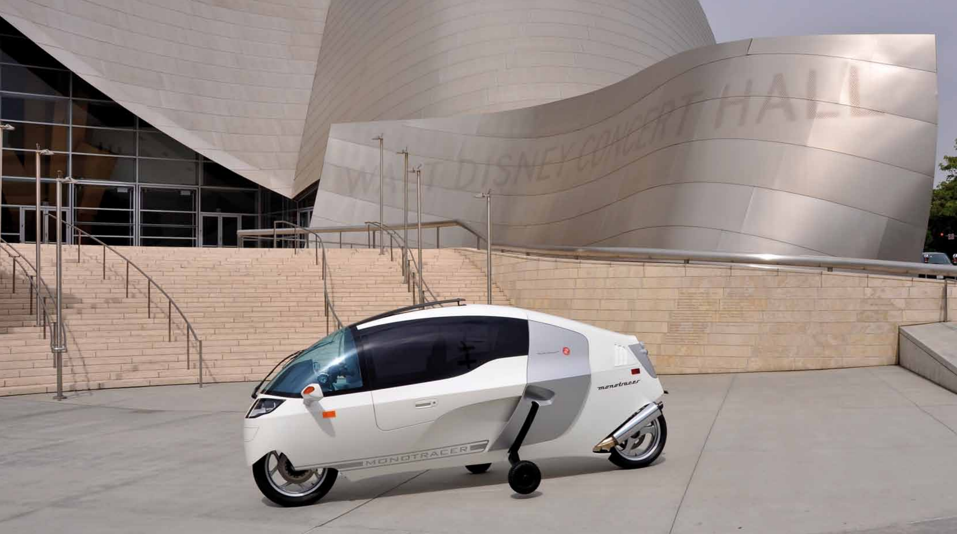
carrara white MonoTracer MTI-1200 BMW in front of Walt Disney Concert Hall in Los Angeles

Mo Tu We Th Fr Sa Su Mo Tu We Th Fr Sa Su Mo Tu We Th Fr Sa Su Mo Tu 1 2 3 4 5 6 7 8 9 10 11 12 13 14 15 16 17 18 19 20 21 22 23 24 25 26 27 28 29 30