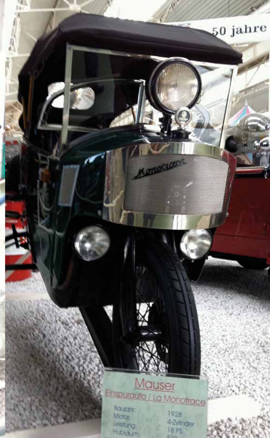
the past: Mauser Einspurauto/«La Monotrace» from 1928, seen at Technikmuseum Sinsheim, Germany

Fr Sa Su Mo Tu We Th Fr Sa Su Mo Tu We Th Fr Sa Su Mo Tu We Th Fr Sa 1 2 3 4 5 6 7 8 9 10 11 12 13 14 15 16 17 18 19 20 21 22 23 24 25 26 27 28 29 30