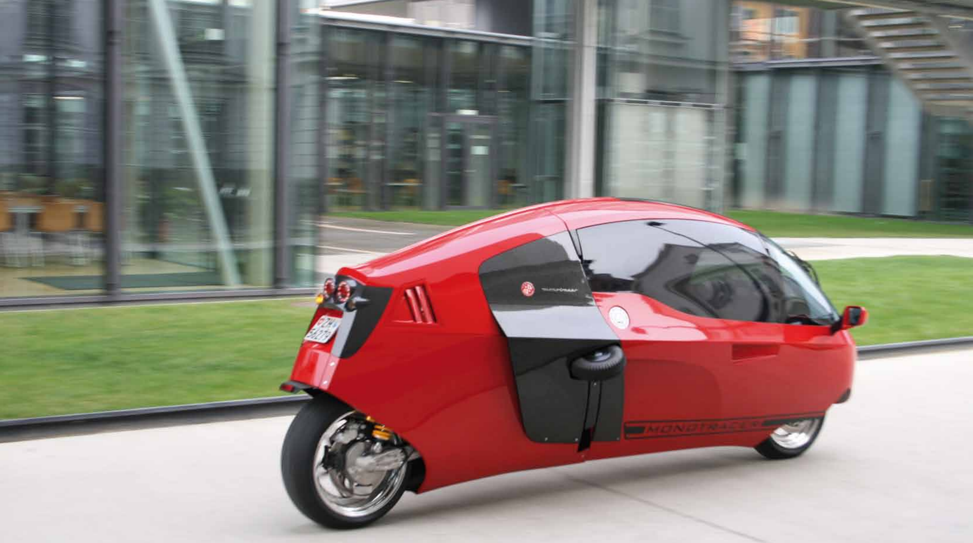
tornado red electric MTE-150 glides across Danube University Krems campus in Austria