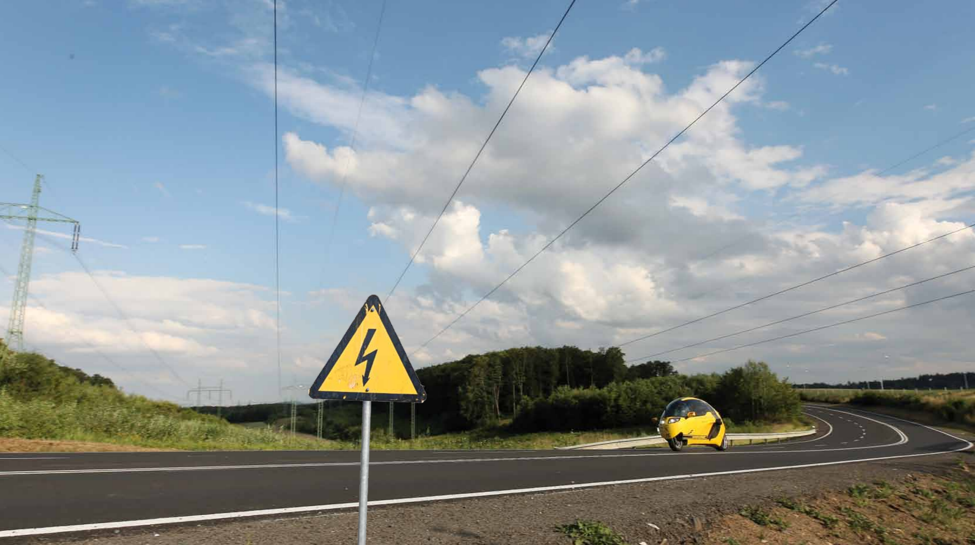
Attention: high voltage! the MTE-150 soars silently underneath power lines near Brno/CZ racetrack